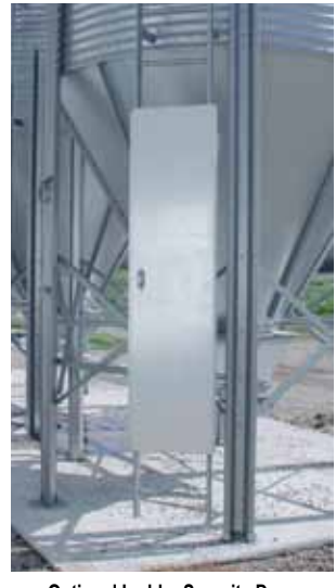
Optional Ladder Security Door