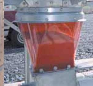
Red translucent boot transition offers highest durability and even flow