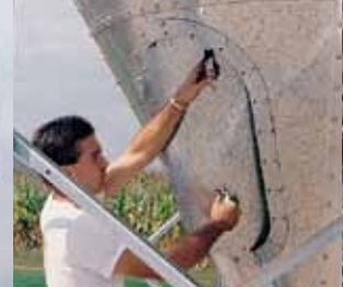
Optional ACCESS PLUS® Hopper Access Door (patented)