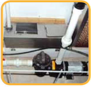
Jet Pump System & Automatic Float Valve