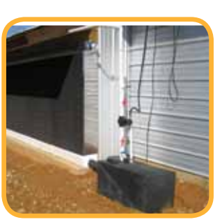
Submersible Pump & Roto Molded Holding Tank